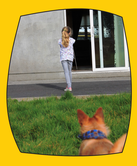
4. Walk away slowly